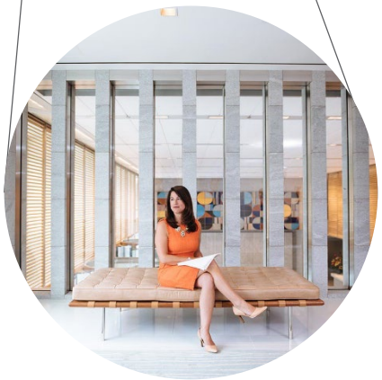
Arent Fox LLP is one of the largest legal tenants in the BID, leasing over 213,000 SF at 1000 Connecticut Ave since its redevelopment in 2012.