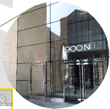
JBG Smith's new 11-story trophy building, 1900 N, just completed.