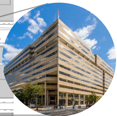
Tishman Speyer plans to renovate the nearly 1.2M-sq ft International Square, adding a ground-floor food hall and new tenant amenities.

Four major building projects recently finished or are wrapping up on 19 th St, with two more just starting: 1333 New Hampshire & International Square.