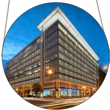
The headquarters of the US Green Building Council (USGBC), which oversees the LEED program, are located at 2101 L Street NW in the BID. It's LEED certified, of course!

LEED buildings account for 15.9M square feet , almost half of the BID's total office space