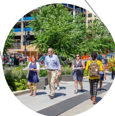
Weekday lunchtime foot traffic near 19 th and L can average as high as 500-850 passersby per hour.