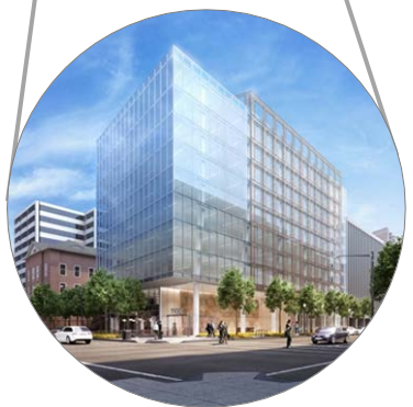
Akridge/COPT razed an older building at 2100 L St NW to make way for 10 stories of spec trophy office. Next door, the historic Stevens School building will be renovated starting in late 2018, to host an early childhood center and School Without Walls annex.