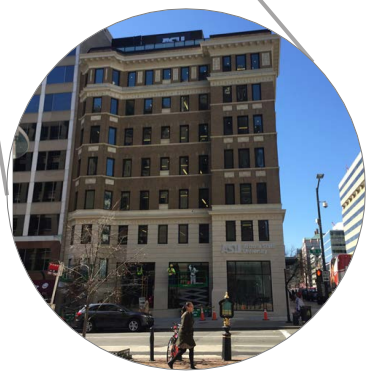
Arizona State University's new D.C. building just wrapped up full-scale renovations, totaling 26,000 sq ft of institutional/office space and classrooms. The building's historic masonry façade was kept and a rooftop conference center added.