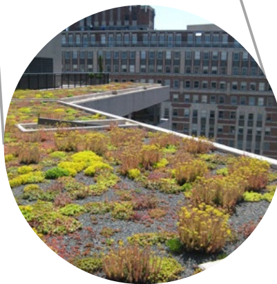
The SEIU building at 1800 Massachusetts Ave has one of the largest green roofs in downtown, at 12,400 sq ft. It is also LEED Platinum certified.

Sources: Golden Triangle property manager survey, GBIG, DOEE, CoStar.