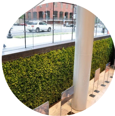
This “green wall” enlivens the lower level lobby of 800 17 th Street NW. The living plants filter indoor air and reduce ambient noise.